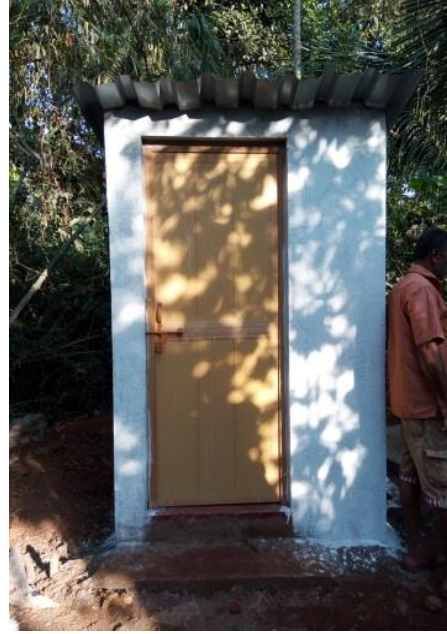
Toilets constructed in Navelim village