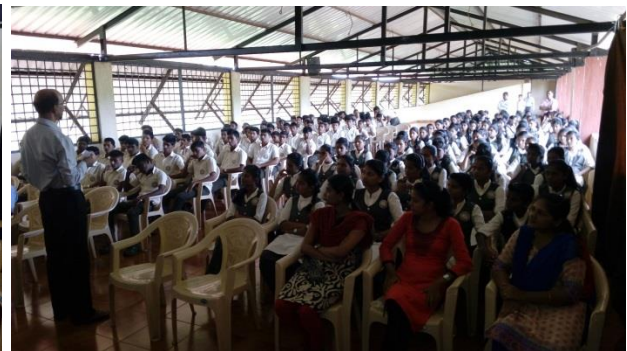
5S awareness in schools to promote culture of cleanliness