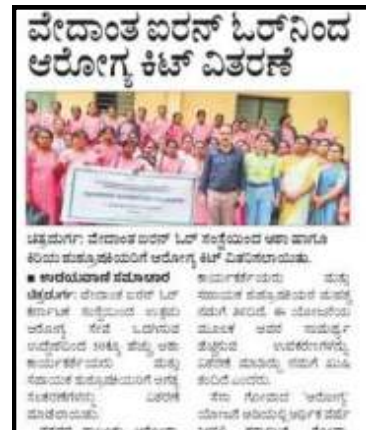
Distribution of Medical Equipment by IOK -Udayavani