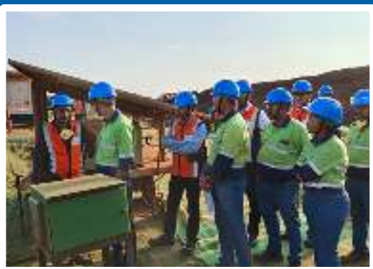
CEO Interaction at the Site

The CEO also engaged with workmen & honored their commitment With the 'Long Service Award' He also inaugurated the 'Reboot Room' - a wellness space for employees.