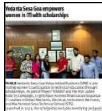
Empowering women with ITI Scholarships -The Goan