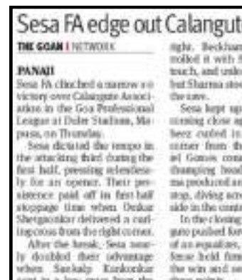
Sesa FA Edge Out Calangute -The Goan