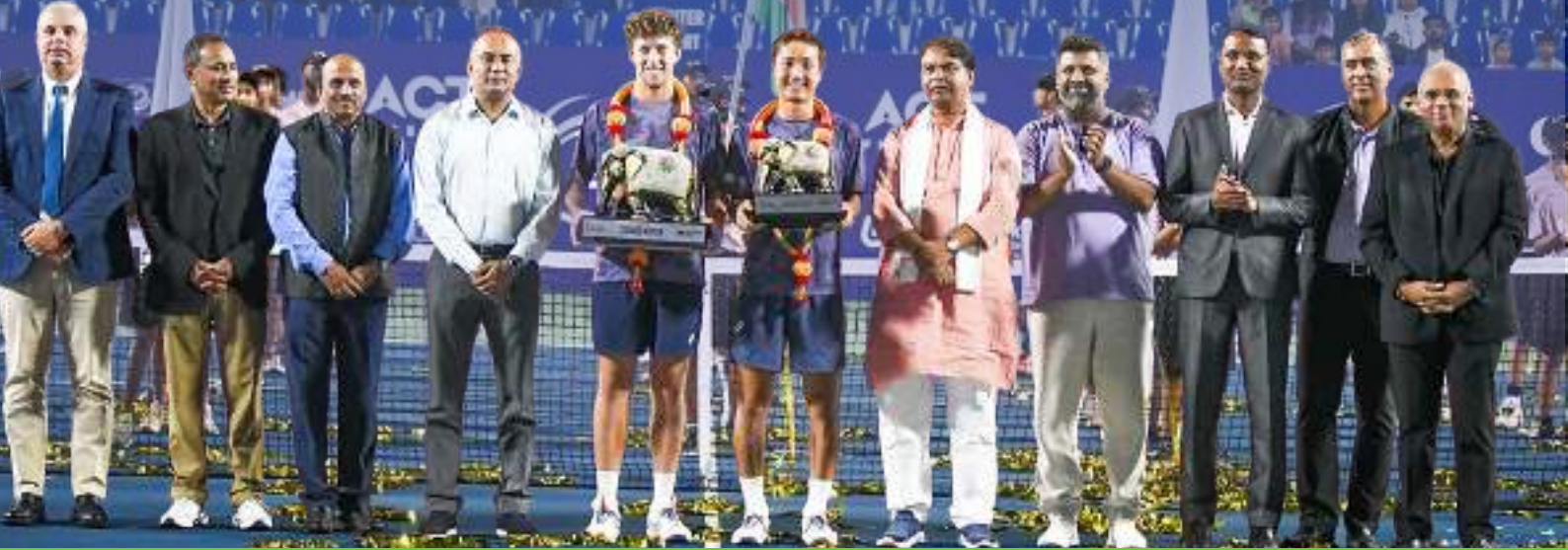
WINNERS OF THE ATP CHALLENGERS 'BENGALURU OPEN' TENNIS TOURNAMENT 2025

In the heart of Bangalore, where passion meets precision on the tennis court, Sesa Goa stepped up to partner the Karnataka State Lawn Tennis Association for the Bengaluru Open 2025 – India's premier ATP Challenger event.