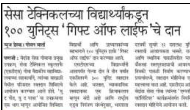
STS Blood Donation Camp -Goan Varta