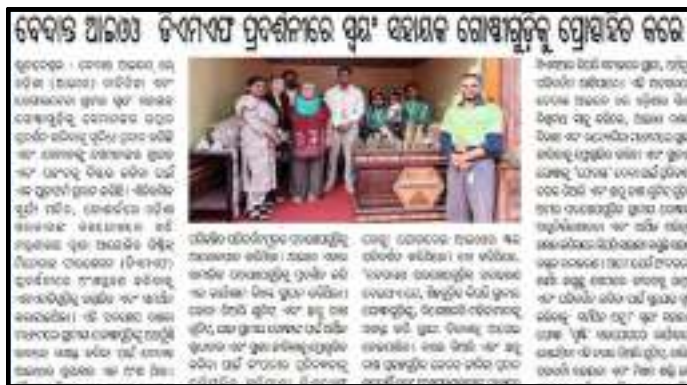
IOO Promotes SHGs -Samaya