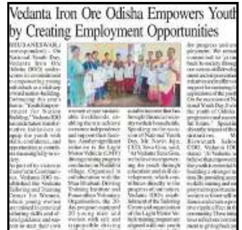
Inauguration of VTTC Gujarat