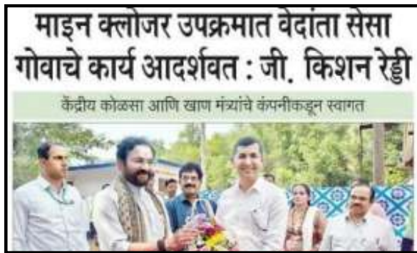
Union Minister Visit to SRM -Tarun Bharat