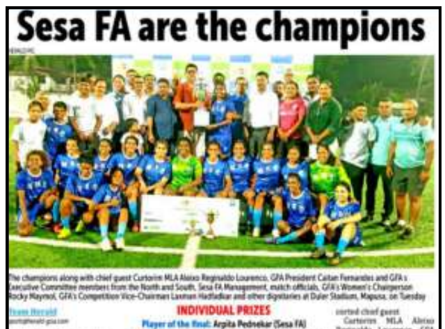
Champions of VWL -O Heraldo