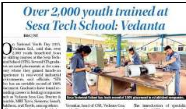
National Youth Day