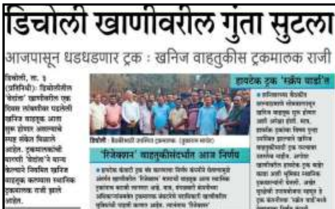
Commencement of Mineral Transportation