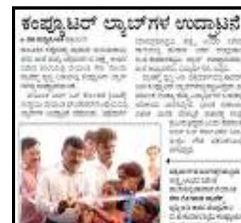
IOK Augments Comp Facilities -Vijaya Karnataka