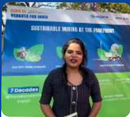
GOA YUVA MAHOTSAV

At the 'Goa Yuva Mahotsav', Vedanta Sesa Goa supported a special segment on Goa's progress & industrial development - #ForAViksitGoa - wherein boys & girls expressed their thoughts & ideas on taking Goa forward in the 21st century.