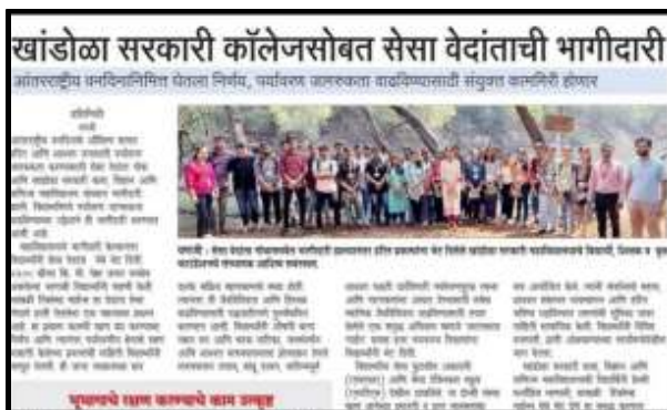
National Forest Day -Tarun Bharat