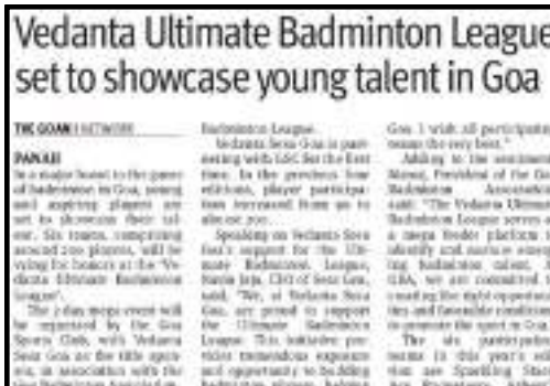
Vedanta Ultimate Badminton League