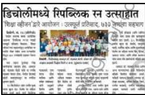
Republic Run by VSG -Dainik Gomantak