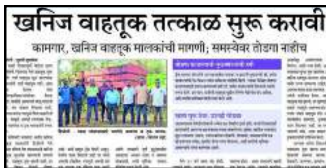
Ore Transportation must resume immediately -Pudhari