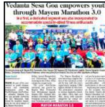
Mayem Marathon 3.0 -O Heraldo