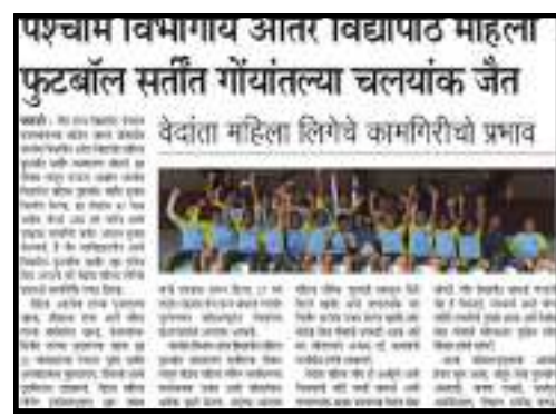
VWL aids win at University Level -Bhaangarbhui