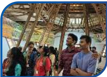
Exploring Bamboo Pavillion