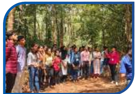
Educational Walk Through