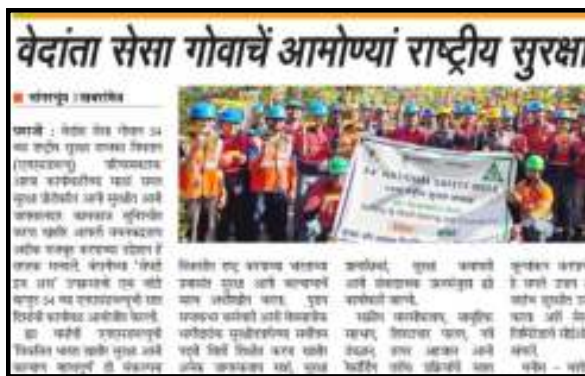
National Safety Week -Bhaangarbhuin