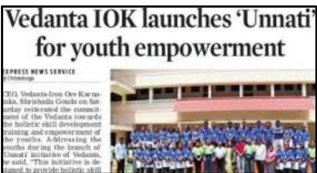
IOK launches 'Unnati' -The New Indian Express