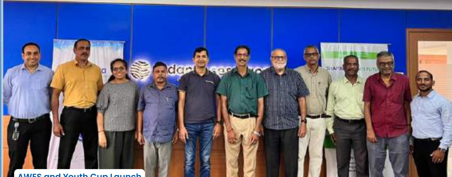
AWES and Youth Cup Launch

Sesa Goa collaborates with 'AWES' to Boost Veterans & Youth Football