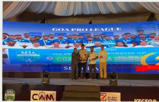
Special Trophy for SFA Senior Men's Team-Runners Up at Goa Pro League'24