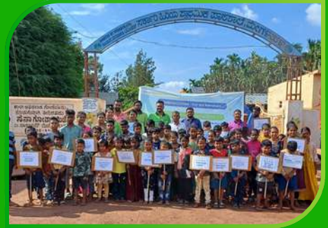
IRON ORE KARNATAKA