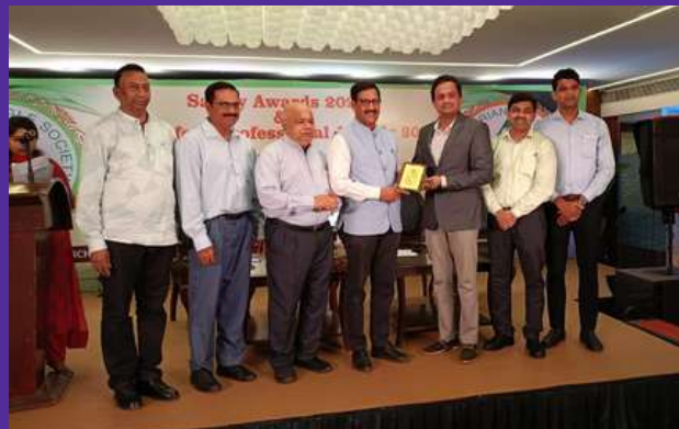
GOMANT SURAKSHA PURUSKAR