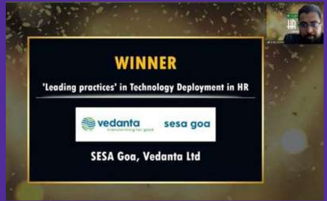
PEOPLE FIRST AWARD- LEADING PRACTICES IN TECHNOLOGY DEPLOYMENT & HR