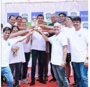
sesafootballacademy and vedanta_sesa_goa sesafootballacademy As part of a gesture to honour the breakout performance of the SFA Senior Men's Team, a FI Football Match was played between the HD EXCO V. IOK EXCO with the HD EXCO emerging victorious with a 4-2-0 #Vedanta #SesaGoa #Transformin... #TransformingWorkplace #Transf...