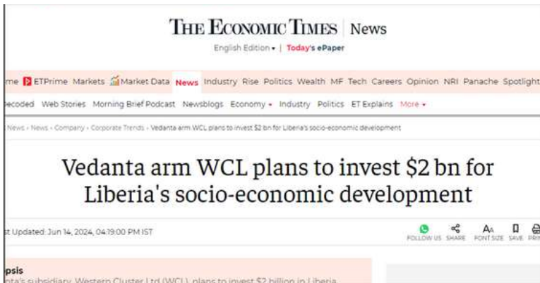
The Economic Times