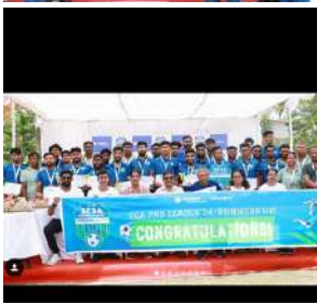
sesafootballacademy and 2 others sesafootballacademy @vedanta_sesa_goa felicit Team that secured a stupendous Runners-Up FI Pro League 24! Congratulations to the team! Keep aiming for the beyond! #SesaFootballAcademy #SesaGoa #SFA #GoaFb vedanta_sesa_goa All the best to the boys for th... 218K Reply