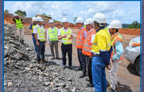
BOMI HILLS MINES VISIT