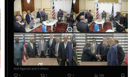
Vedanta Sesa Goa @SesaGoaIronOre · Jun 13 He reaffirmed the commitment of WCL towards the economic development, progress and prosperity of the people of Liberia.