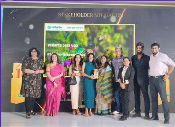
IPRCC E4M PR AWARD-'STAKEHOLDER MITIGATION' #SesaForGreenerGood