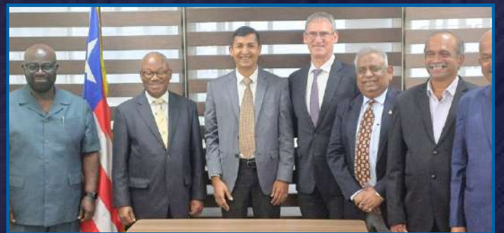
JOINT PRESS CONFERENCE

“ We want Western Cluster Limited to be here and we welcome this investment. We want people to benefit from this investment.