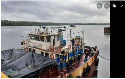
Vedanta Sesa Goa IOK Vedanta Sesa Goa has comm... #Vedanta #SesaGoa #Transf...