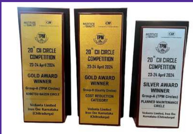
CII CIRCLE COMPETITION - 2024