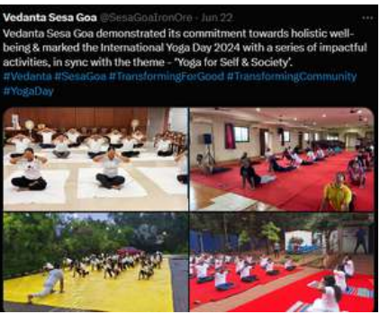
Vedanta Sesa Goa @SesaGoaIronOre · Jun 22 Vedanta Sesa Goa demonstrated its commitment towards holistic well-being & marked the International Yoga Day 2024 with a series of impactful activities, in sync with the theme - "Yoga for Self & Society". #Vedanta #SesaGoa #TransformingForGood #TransformingCommunity #YogaDay