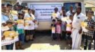
ವೇದಾಂತ್‌ನಿಂದ ಮಲೇರಿಯಾ ವಿರುದ್ಧ ಹೋರಾಟಕ್ಕೆ ನೆರವು. ವೇದಾಂತ್‌ನಿಂದ ಮಲೇರಿಯಾ ವಿರುದ್ಧ ಹೋರಾಟಕ್ಕೆ ನೆರವು.

ವೇದಾಂತ್‌ನಿಂದ ಮಲೇರಿಯಾ ವಿರುದ್ಧ ಹೋರಾಟಕ್ಕೆ ನೆರವು. ವೇದಾಂತ್‌ನಿಂದ ಮಲೇರಿಯಾ ವಿರುದ್ಧ ಹೋರಾಟಕ್ಕೆ ನೆರವು. ವೇದಾಂತ್‌ನಿಂದ ಮಲೇರಿಯಾ ವಿರುದ್ಧ ಹೋರಾಟಕ್ಕೆ ನೆರವು.