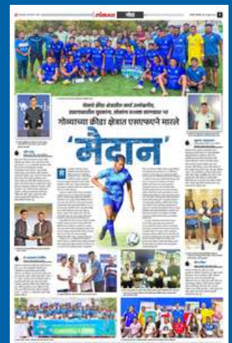
Full page Feature in Lokmat

#SFAcubs shone with their credible 3rd Place finish in respective U-15 & U-17 GFA Leagues.