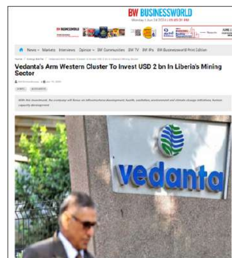
BW Business World