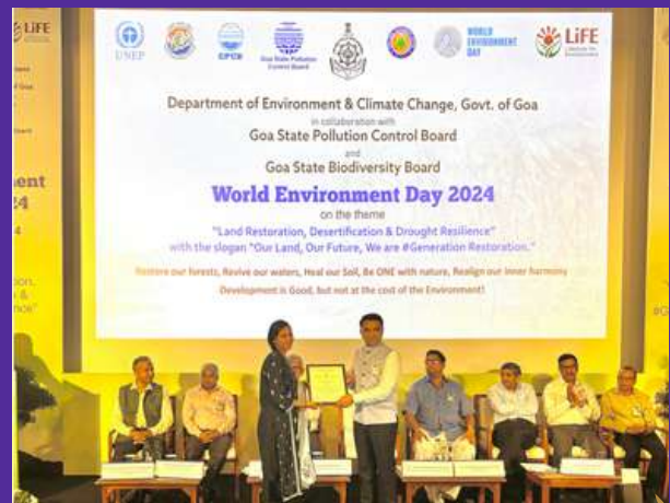
VAB - ENVIRONMENT BEST PRACTICES AWARD