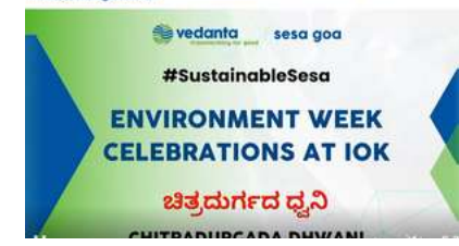
Vedanta Sesa Goa 34,875 followers Vedanta Sesa Goa, IOK, celebrated Environment Week with a series of captivating initiatives! Tune in to Chitradurgada Dhwani 'ಚಿತ್ರದುರ್ಗದ ಧ್ವನಿ' where we take you through the exuberant Journey showcasing #SustainableSesa. Happy viewing! #Vedanta #SesaGoa #IOK #ChitradurgadaDhwani #TransformingPlanet #TransformingForGood