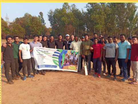
FRIENDLY CRICKET AT RENGALBEDA VILLAGE

The events were meticulously planned & conducted by CSR team at IOO in-concert with a motivated & inspired team of volunteer employees. The initiatives received a positive response & ensured that a stronger bond developed between IOO & the community members testifying to the high degree of coordination, commonality of intent & commitment between the employees at IOO.