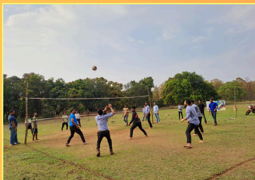
FRIENDLY VOLLEYBALL MATCH AT NADIDHI VILLAGE