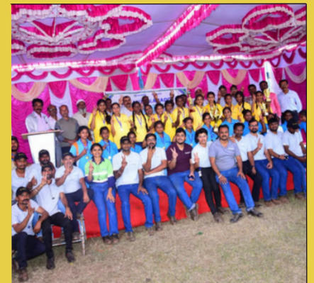
Culmination of the VKPL at Chitradurga, Karnataka