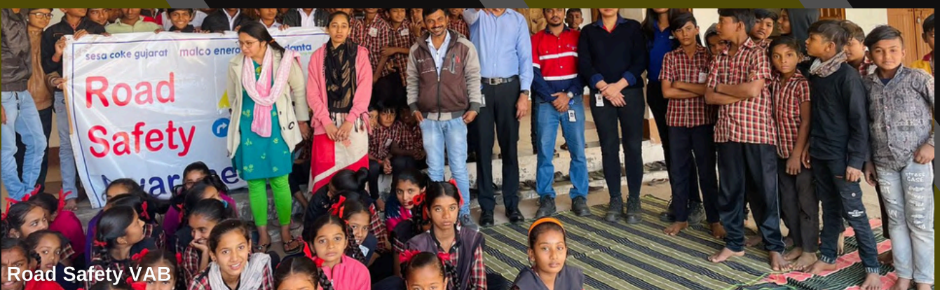
Road Safety VAB