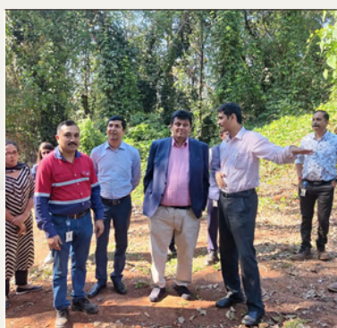
Visit to Sanquelim Reclaimed Mine