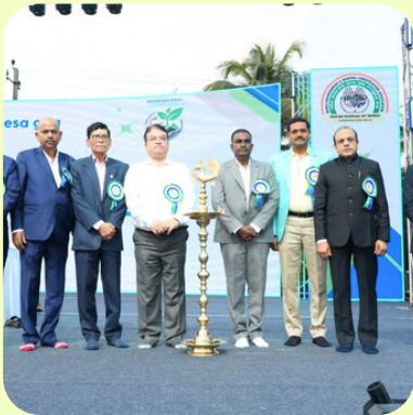
Dignitaries from Indian Bureau of Mines & Vedanta Sesa Goa on the dais