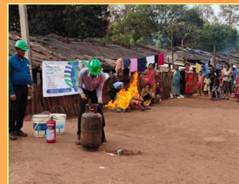
AWARENESS SESSION ON 'FIRE & SAFETY' AT RENGALBEDA