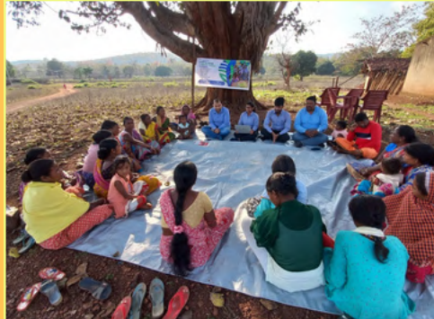
FINANCIAL LITERACY SESSION AT KENDUDHI VILLAGE