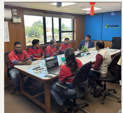
Business Overview: Sesa Coke Vazare