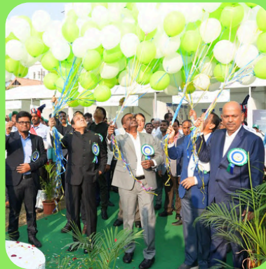
Dignitaries releasing balloons, marking the inaugural of the MEMC event