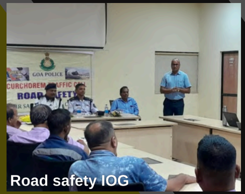
Road safety IOG