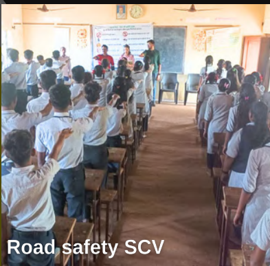
Road safety SCV

National Road Safety Week was marked across Sesa Goa, with over 6000 employees, workmen & business partners being engaged through multiple activities across all business locations. The initiatives also covered engagement with the community emphasising consciousness through awareness sessions. The Security Deptt. played an active role in drawing collaboration from the Traffic Police.