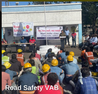
Road Safety VAB