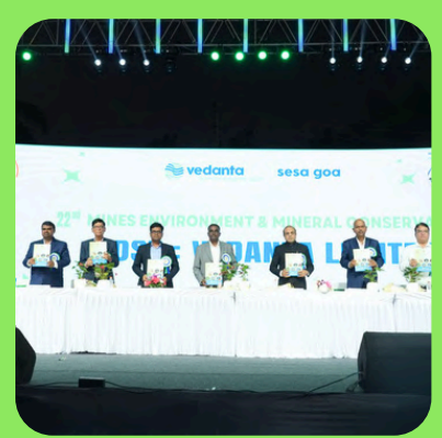
Release of the MEMC Souvenir 2023-24 at Davangere