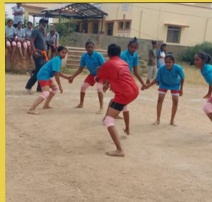
Young schoolgirls battle it out in the finale of the Kabaddi Premier League