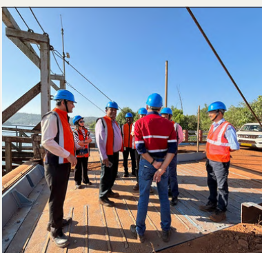
Briefing at Sarmanas Jetty