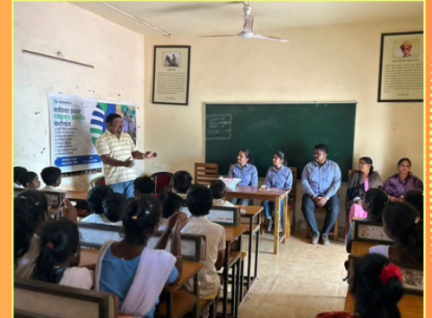
FUN & LEARN SESSION AT GOVERNMENT UP SCHOOL

With the aim of deepening bonds with the community & to promote employee involvement, IOO organised the Employee Volunteerism Week comprising over 50 hours of meaningful participation. 32 employees actively contributed in organising & conducting eight impactful interaction sessions with the community members.