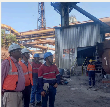
Site & Plant Visit: VAB