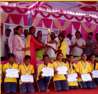
Winners were awarded at the grand finale of the Kabaddi Premier League

The enthusiastic participation is a testament to Vedanta Sesa Goa's commitment to promoting sports and fostering a spirit of healthy competition among the youth. The winners and runners-up, along with the best 'Catcher' and the best 'Rider' were presented with trophies, medals, and certificates, acknowledging their wonderful performance throughout the tournament.