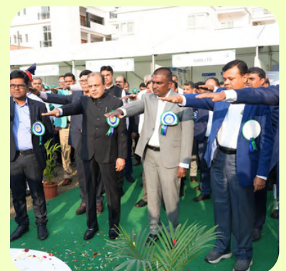
MEMC oath taken, striving towards protection of the environment

Embracing the spirit of sustainable mining is not merely a duty, but a solemn commitment to safeguard our planet's resources. As we celebrate the 22nd 'Mines Environment and Mineral Conservation' journey, let us forge ahead with a unified resolve to harmonize our mining practices with environmental stewardship. Together, we can pave the way for a future where the riches of our land coexist seamlessly with the imperative of conservation.