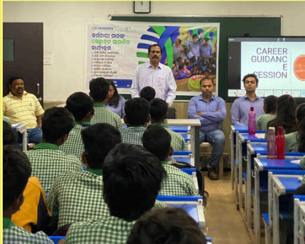
CAREER GUIDANCE SESSION AT UCHHOVIDYALAYA