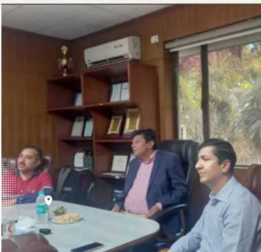
Briefing on Operations

The two-day visit was an invigorating experience & inspired all to continue to deliver value and to contribute to the larger aim of #ViksitBharat .